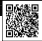
Scan for a ticket

Check out the WSO redesigned website! See you in the next concert!